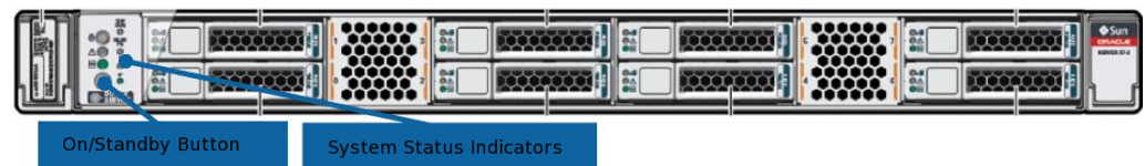
Figure 1-3 Front Panel