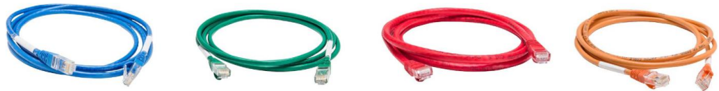
Figure 1-2 Cables