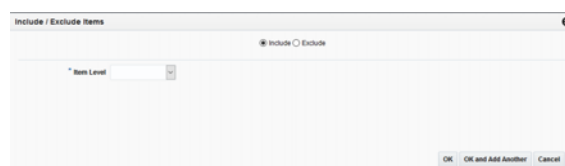
Figure 3–4 Include/Exclude Items Pop-up