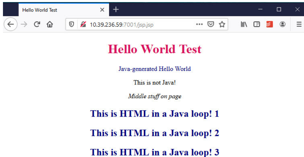
Figure 12-1 Compiled JSP with HTML and Embedded Java

After the code shown here is compiled, the resulting page is displayed in a browser as shown in the following figure.