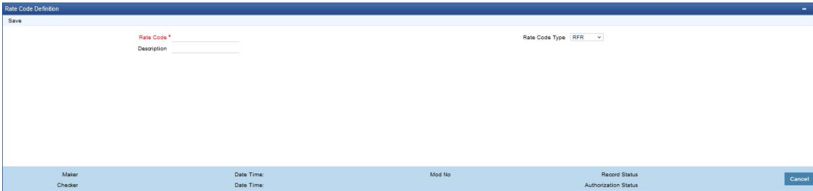
Figure 7.1: Rate Code Definition

STEP RESULT: Rate Code Definition screen is displayed.