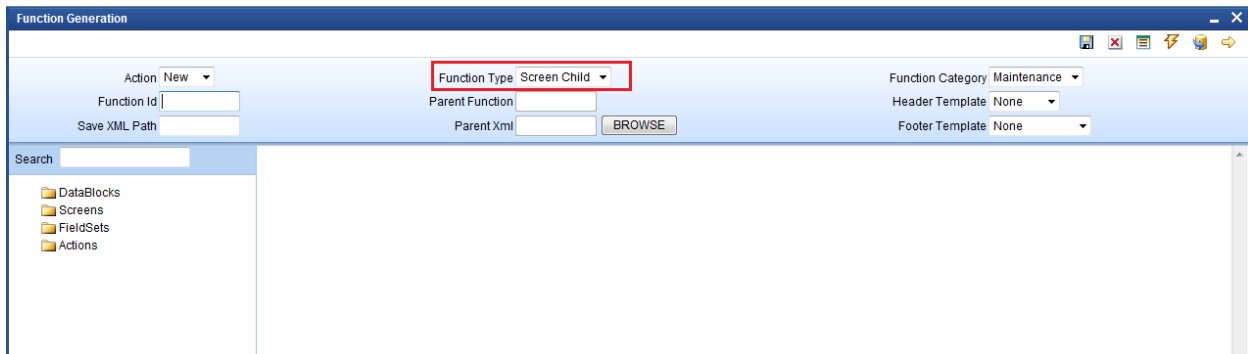
Fig 4.1: Screen Child Option to be selected

Only 4 nodes of the parent can be modified in a Screen Child