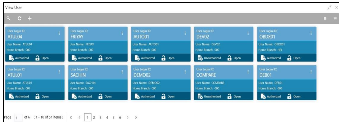
Figure 1.3: View User

For more information on menus, refer to Table 1.3: View User - Field Description .