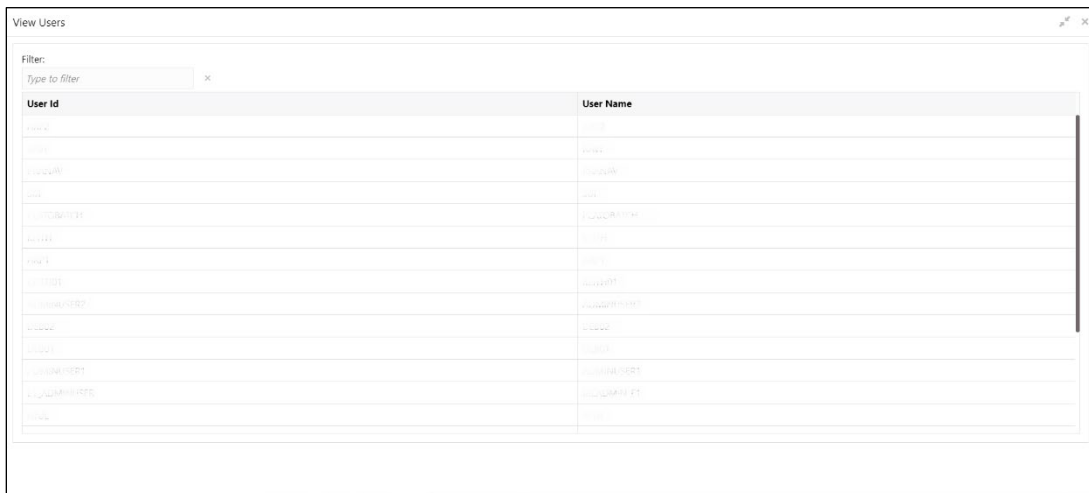
Figure 9: View Users