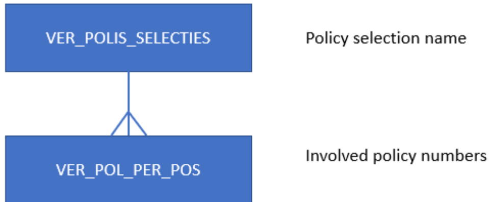
Figure 3.2: Policy selection tables.

It might be more convenient to use a SQL tool, such as SQL*Plus, to create the necessary rows manually in these tables.