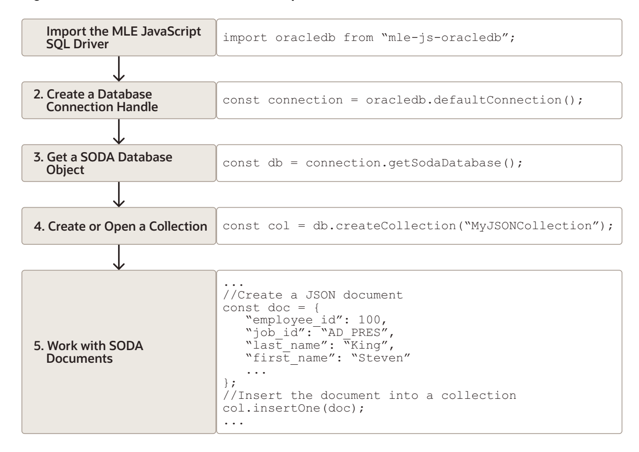
Figure 7-1 SODA for In-Database JavaScript Basic Workflow

Applications that aren't ported from client-side Node.js or Deno can benefit from coding aids available in the MLE JavaScript SQL driver, such as a number of frequently used variables that are available in the global scope. For a complete list of available global variables and types, see Working with the MLE JavaScript Driver.