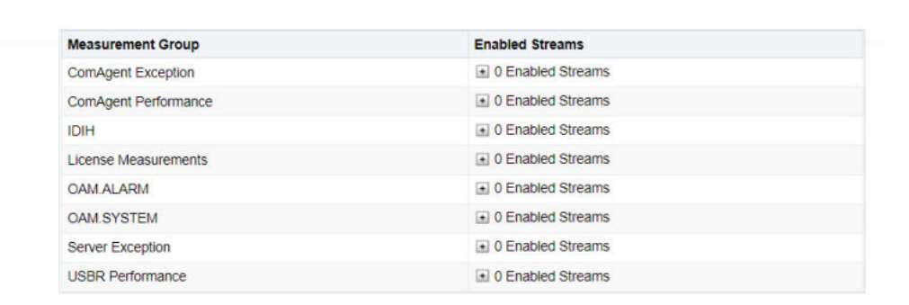
Figure 8-1 Measurements Streaming

From the Main Menu, select Measurements Streaming, and click Streams.