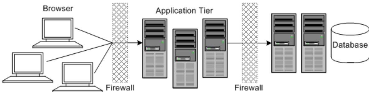
Figure 1-3 Clustered Server Deployment

In this scenario, the application tier is isolated by firewalls from both the Internet and the intranet. The database and servers are protected from potential attacks by two layers of firewall. Both firewalls can be configured to block known illegal traffic types. The two layers of firewall provide intrusion containment. Although there are a greater