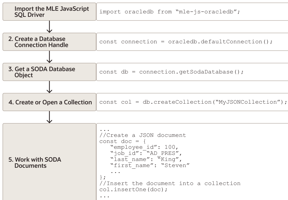
Figure 7-1 SODA for In-Database JavaScript Basic Workflow

Applications that aren't ported from client-side Node.js or Deno can benefit from coding aids available in the MLE JavaScript SQL driver, such as a number of frequently used variables that are available in the global scope. For a complete list of available global variables and types, see Working with the MLE JavaScript Driver .