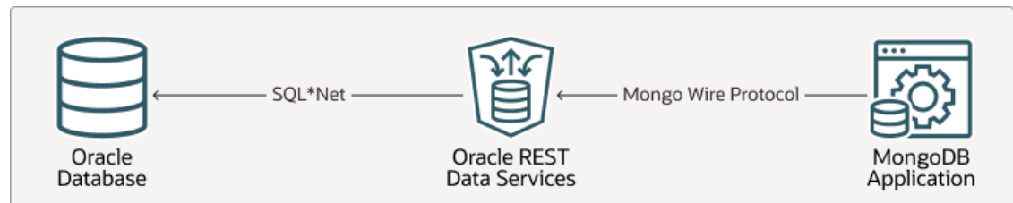
Figure 10-1 Architecture Diagram for Oracle Database API for MongoDB

Starting with ORDS release 22.3, Oracle REST Data Services supports the Oracle Database API for MongoDB when running in a standalone mode. This enables the use of MongoDB drivers, frameworks, and tools to develop your JSON document-store applications against the Oracle Database. The Oracle Database API for MongoDB, translates the MongoDB wire protocol into SQL statements that are executed using the ORDS connection pools.