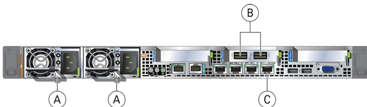
Table 6.1 Figure Legend