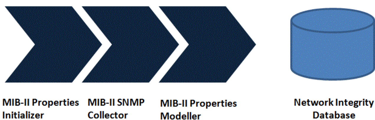
Figure 5-1 Discover MIB-II SNMP Action Chain

Figure 5-1 depicts the Discover MIB-II SNMP action chain.