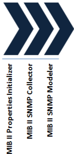
Figure 2-1 Discover MIB-II SNMP Action Processor Workflow

Figure 2-1 illustrates the processor workflow of the Discover MIB-II SNMP action.