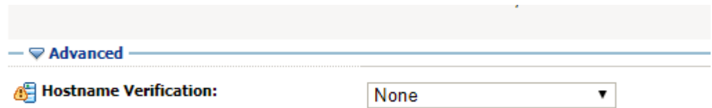
Figure 5-4 Hostname Verification

The screen with the Hostname Verification option is displayed.