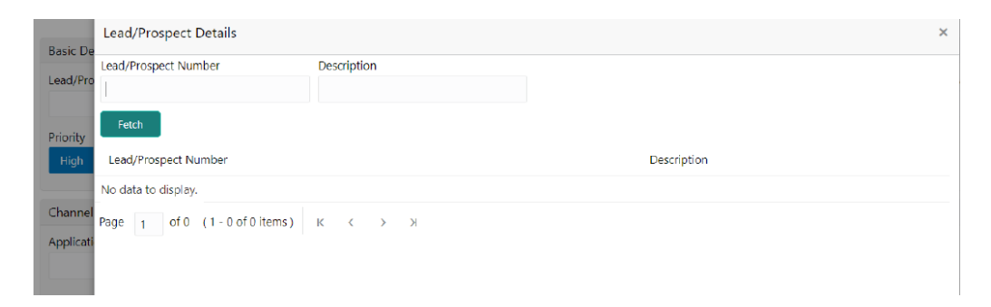
Figure 1-2 Lead-Prospect Details

You are not able to find an existing loan while initiating the process flow.