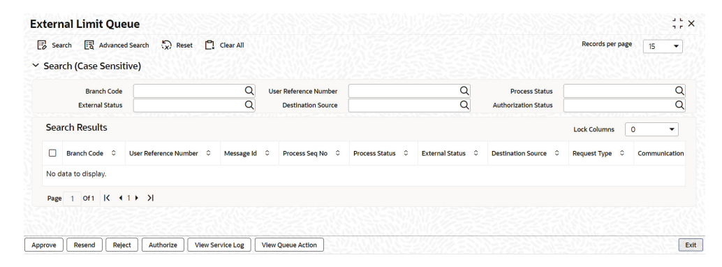
Figure 2-2 External Limit Queue screen