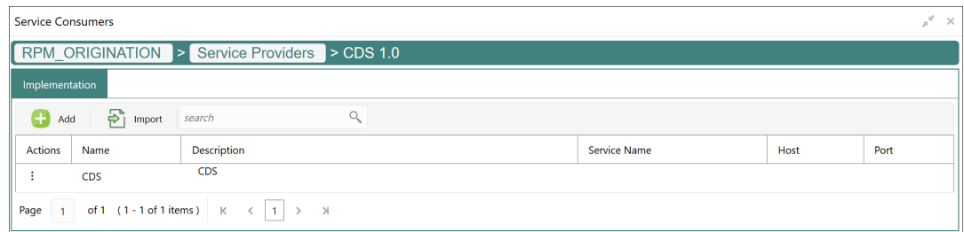
Figure 1-3 RPM_ORIGINATION - CDS