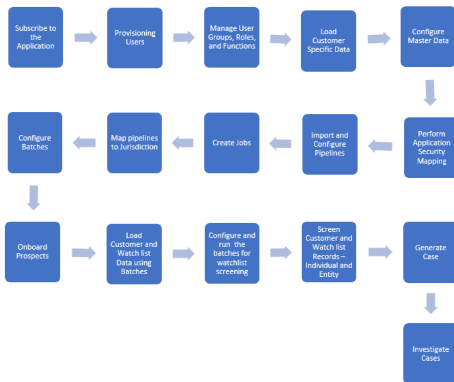
Figure 1-1 Process Flow for Administrator

The system administrator can perform the required tasks and configurations in the following order. Optionally, you can also configure and execute pipelines on a new environment, and import or copy pipelines if you are moving data between environments.