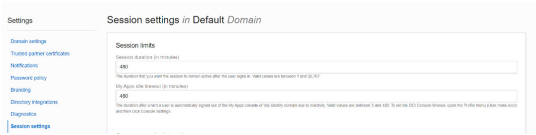
Figure 6-1 Session Settings

You can configure the Session Lifetime Timeout using your Identity Domain Settings in OCI Console. Ensure that you have the Security Administrator Role mapped to access and modify the settings. To configure the session timeout: 1. Log in with your Security Administrator Account . 2. Navigate to the Domain page. Click Settings and select Session Settings . 3. Specify the Session Duration under Session Limits . Enter the required value. By default, this is set to 480 Minutes.