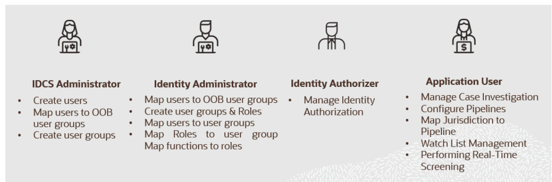
Figure 3-1 User Persona Details

The following figure shows the User Persona Details: