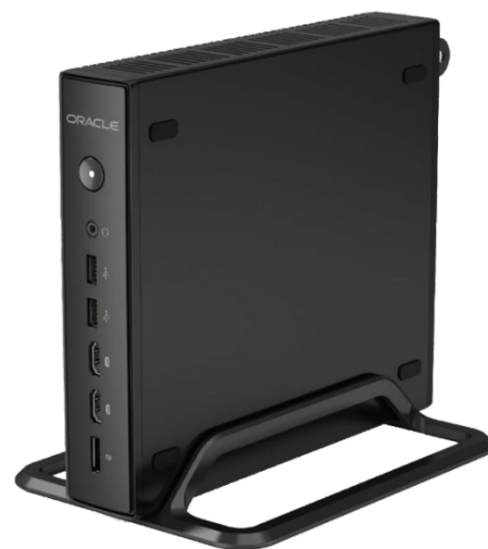
Oracle MICROS Edge Controller 250 with tabletop stand

The Oracle MICROS Hardware Safety and Compliance Guide provides product safety and compliance information.