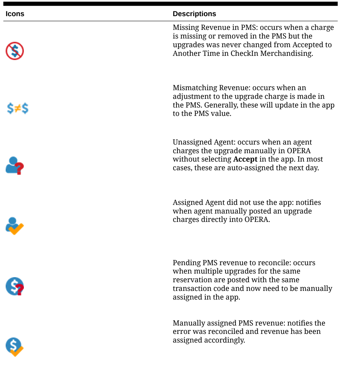
Table 6-1 Notifications and Descriptions

After synchronizing the property management system (PMS) data with the app data, CheckIn Merchandising can detect errors using the property management system (PMS) data from the data sync.