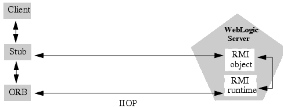
Figure 9-1 RMI Object Relationships