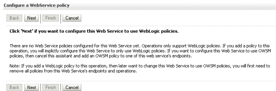
Figure A–3 WebLogic Server Policy Page