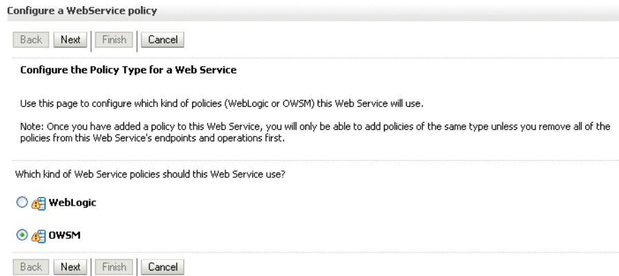
Figure A–2 Selecting the Oracle WSM WS-Security Policy Type