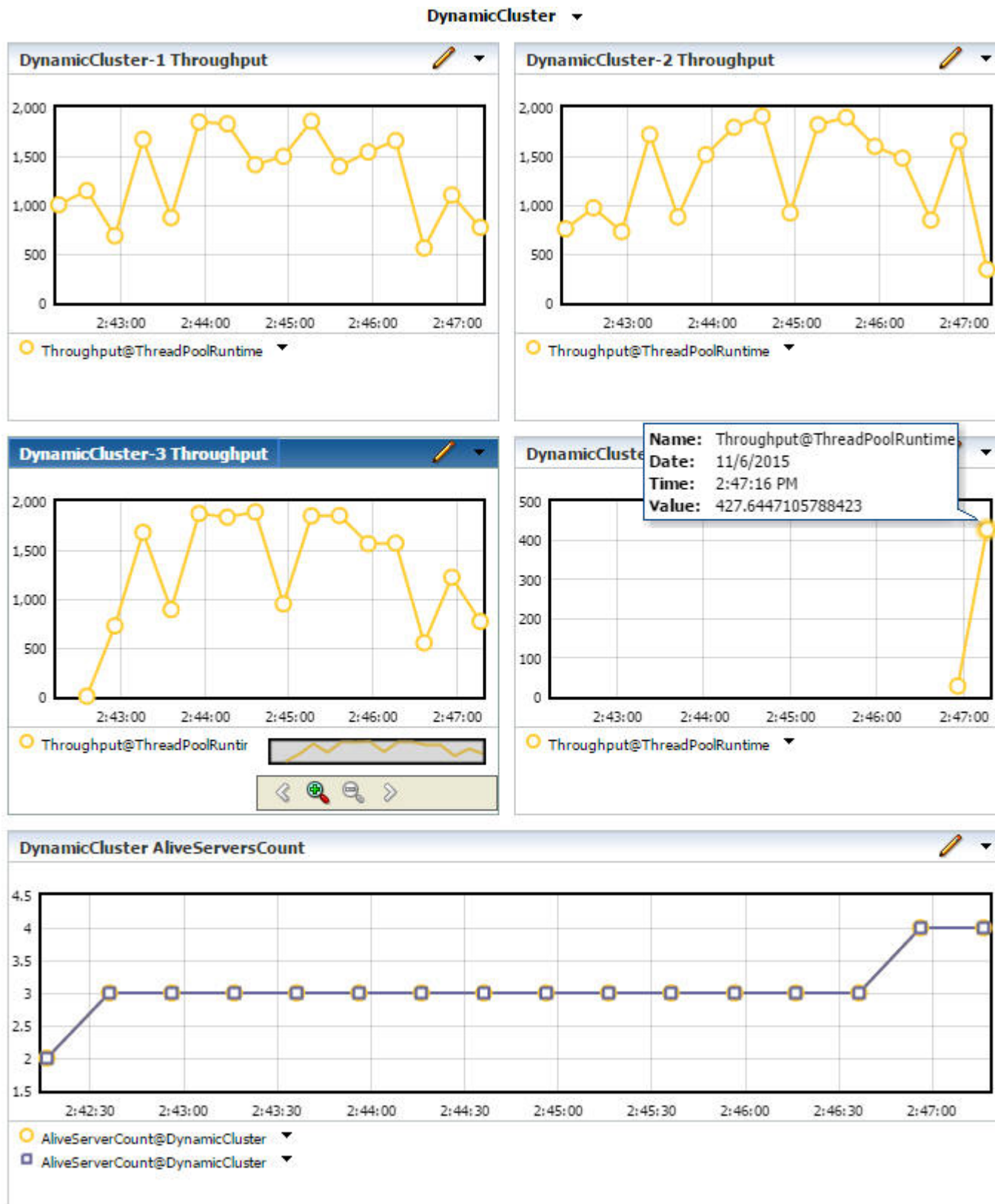
Figure 7-3 Dynamic Server Scaling Activity