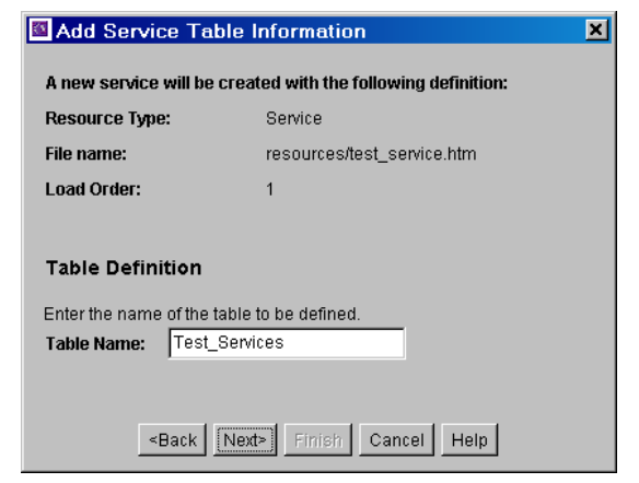
Figure 3-8 Defining a New Service Table

1. In the Add Service Table Information, enter a name for the service table.