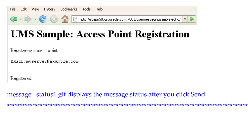
Figure A–12 Access Registration Status

5. Send a message from your messaging client (for email, your email client) to the address you just registered as an access in the previous step.