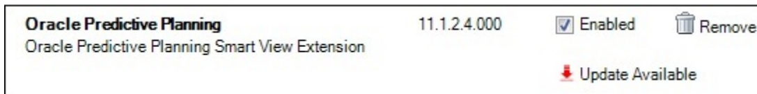
Figure 2 Extension as Displayed in the Extensions Tab

Figure 2 shows an example of an extension displayed in the Extensions tab.